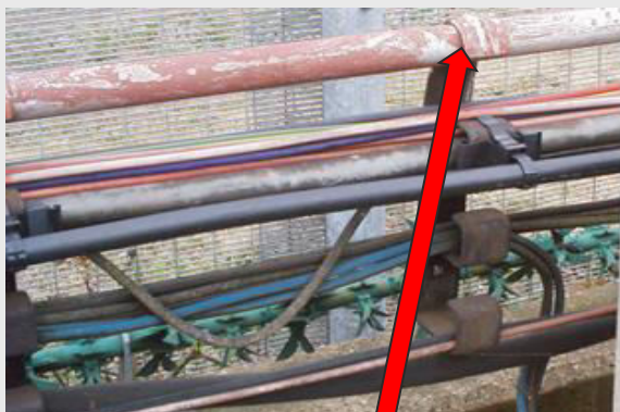
Packing to cable hangers