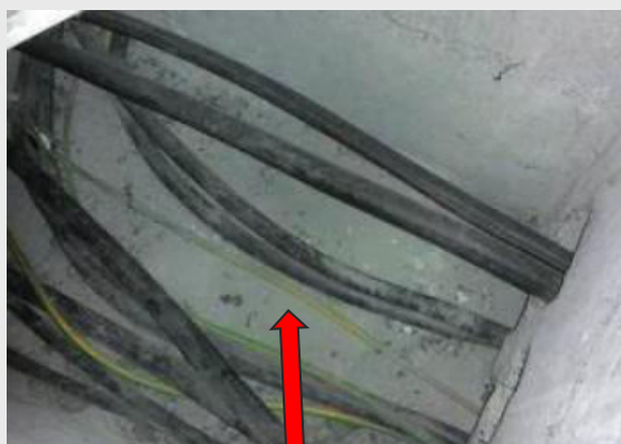
Cable run with dust/debris